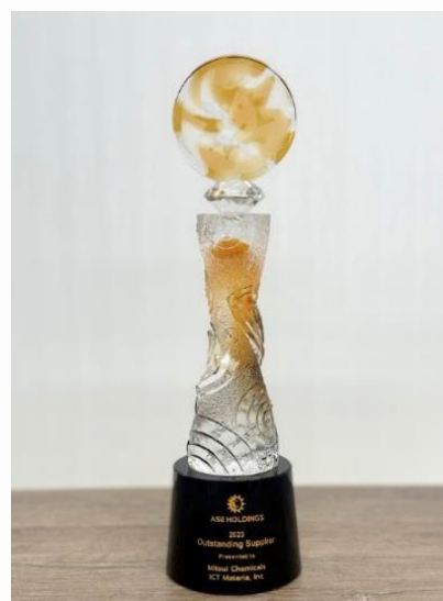
The award trophy